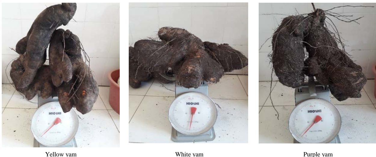
Yellow yam Figure 3. Three potential types of Dioscorea alata