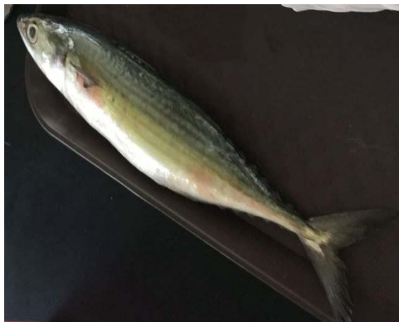
Figure 1. Rastrelliger brachysoma (Short Mackerel)

Parasites are used increasingly as indicators for the differentiation of marine ecology because parasitic fauna might show a distribution parallel to the host (Madhavi and Lakshmi, 2012). Parasites in fish have been a great concern since they often produce disease conditions in fish which will lead to reduced growth, increase in the fishes' susceptibility to other diseases as well as fish loss (Raissy and Ansari, 2012). Effects of parasitism in fish range from mild to severe depending upon the intensity and pathogenicity of the parasites. As a result, there is a great threat to the fish industry which may result in the failure of production, and some infected fish could be unsuitable for human consumption.