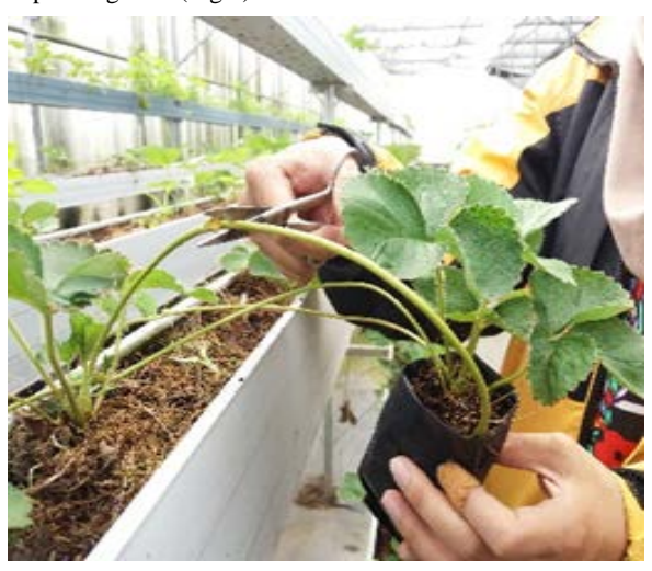
Figure 1. One-month old strawberry seedlings before being cutting from the mother plant and transplant.

Bandung Barat Regency at the altitude of 1,225 m above sea level. The location situated in tropics with average annual temperature 17-26°C and humidity 70-90%. Urea was coated with solid inoculant of N-fixing A. vinelandii and A. chrococcum, and phosphate-solubilizing B. subtilis and B. megaterium consortia developed by the Soil Biology Laboratory Faculty of Agriculture, Universitas Padjadjaran. Liquid inoculant of all bacteria was prepared in molasses based broth enriched with N source (Hindersah et al., 2020b). The Azotobacter and Bacillus produced phytohormone of indole acetic acid (IAA), cytokinins (CK) and gibberellins (GA) in the in-vitro test (Hindersah et al., 2020b). The seedlings of strawberry cv. Festival were provided by Bumi Agrotechnology Farm. Four-week old daughter plants of strawberry growing on the tip of stolon have been separated from the mother plant at planting time (Fig 1).