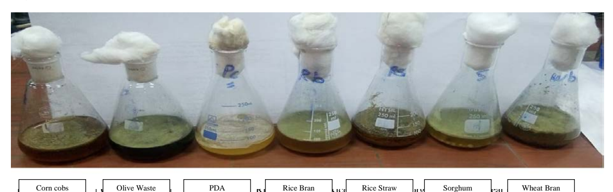
Figure 1. A. pseudocaelatus cultivated on media contain different agricultural industrial wastes as carbon sources

Both fungi showed the capability of utilization of different agricultural industrial wastes used as carbon sources. As shown in Fig.1.