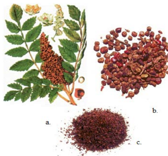
Figure 1. Rhus coriaria L. plant and fruits; a. Sumac plant (leaves, fruits, and flowers) b. Sumac fruits c. Sumac fruit powder.

possesses high fixation, retention and fungal resistance properties, and is useful against wood decay (Sen et al. , 2009). So far, a big deal of nutritionally and medicinally considerable metabolites (such as phenolic acids, tannins, anthocyanins, organic acids, proteins, essential oils, fatty acids, fiber, and minerals) have previously been identified from various parts of R. coriaria (Shabir, 2012).