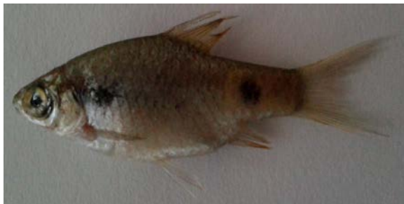
Figure 1. Photo of Pethia ticto , collected from the Ganges River, northwestern Bangladesh on 5 June 2015

A total of 100 individuals of P. ticto (see Figure 1) was collected occasionally from the Ganges River (24°22' N; 88°35' E; known as the Padma River in Bangladesh) during July 2014 to October 2015 using various types of traditional fishing gears that include cast net (mesh size ranges: 1.5 - 2.5 cm), gill net (mesh size ranges: 1.5–2.0 cm), and square lift net (mesh size: ~2.0 cm). The fresh samples were instantly chilled in ice on site and fixed with 10% buffered formalin upon arrival in the laboratory, where all morphometric and meristic features were computed according to Froese & Pauly (2016).